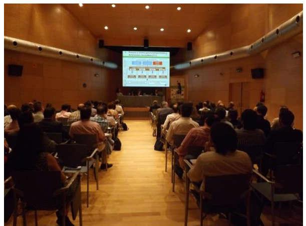
Market Event - Bilbao (12.06.14)

In line with Public Procurement of Innovation best practices, the PAPIRUS Consortium started informing potential suppliers about the coming tenders long before the official tender publication. In 2014 five Market Events have been organized in Turin, Oslo, Bilbao, Enzkreis and in Brussels.